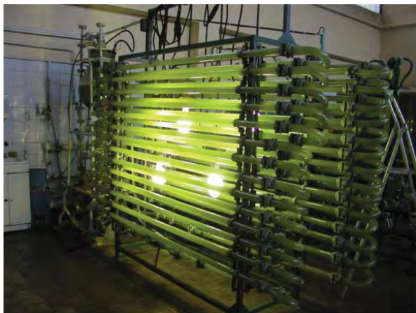
Fig. 2. Experimental tubular photobioreactor of biotechnological complex of the Institute of Hydrobiology of the National Academy of Sciences of Ukraine