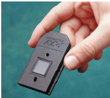
Fig. 1. The outward of a DNA microchip brand Affymetrix GeneChip

known reactions to thermal fluctuations and widespread pollutants (cadmium, oil and so forth), the genetic transformations in an organism of fishes caused by influence of vegetable ingredients of fishfood, which today replace even more often the components of an animal origin with, are intensively studied in recent years.