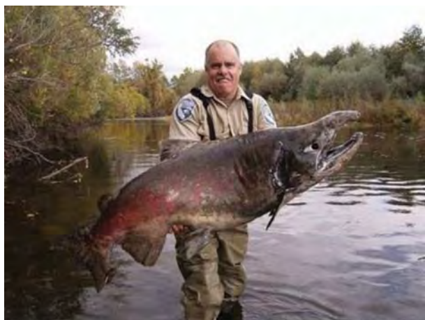
Fig. 4. Atlantic salmon ( Salmo salar ), the modified GH chinook salmon ( Oncorhynchus tshawytscha )

Based on the DNA microarray technique it was done, a series of studies on the effects of transgenic food fish, in particular the effect of growth hormone (GH), all of which the fish grows more than usual in the shortest time (Fig. 4).